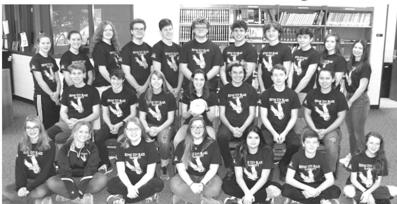
The 2020 BC Blaze Robotics Team.

B.C. Blaze has grown from 6 students to 32 high school students. Adult mentors, including seven alumni, help the team in a variety of tasks.