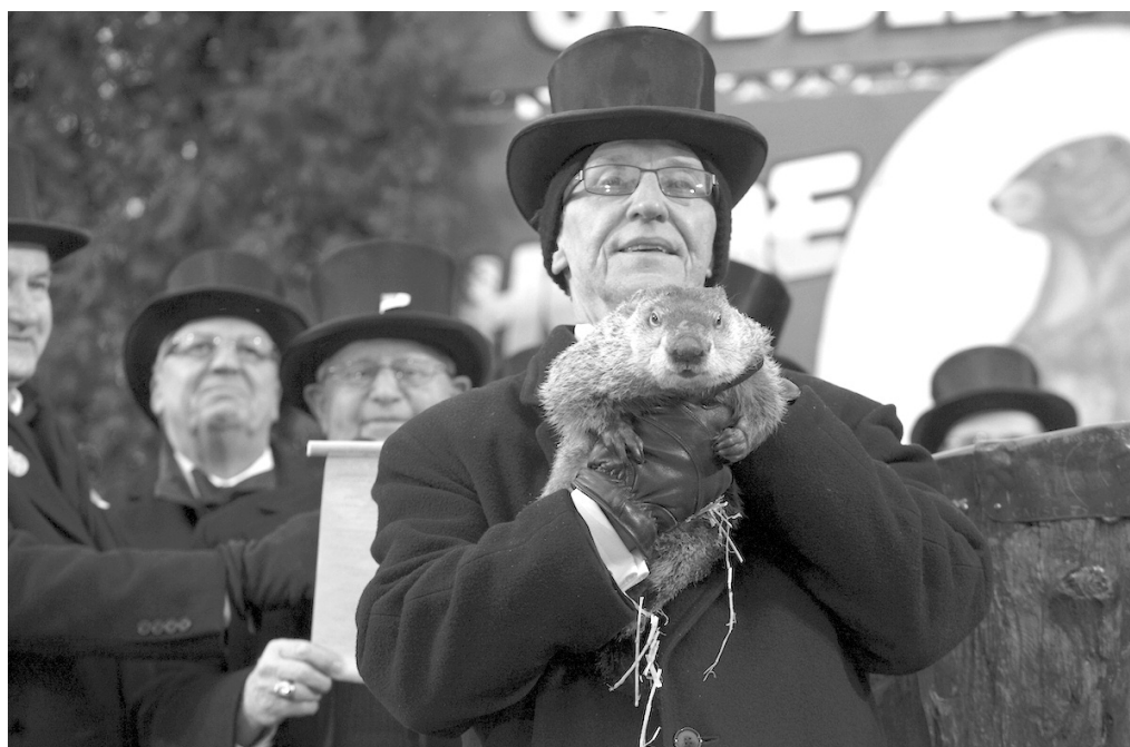
When Punxsutawney Phil emerges from its burrow on February 2; if he sees a shadow due to clear weather, he will retreat to its den and winter will persist for six more weeks. If he does not see its shadow because of cloudiness, spring will arrive early.

In terms of accuracy, "live-science.com" found that Phil has predicted over 100 forecasts of six more months of winter and only about 20 for an early spring. Data from "Stormfax Almanac" show this to be around thirty-nine percent accurate. Looking at the years since 1969, that ac-